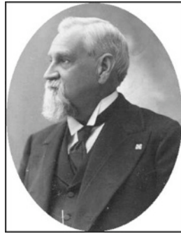
Lt. General Stephen Dill Lee, Commander General, United Confederate Veterans, New Orleans, Louisiana April 25, 1906

"To you, Sons of Confederate Veterans, we will commit the vindication of the Cause for which we fought. To your strength will be given the defense of the Confederate soldiers' good name, the guardianship of his history, the emulation of his virtues, the perpetuation of those principles which he loved, and which you love also, and those ideals which made him glorious, and which you also cherish."