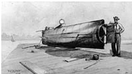
Drawing of the H. L. Hunley. Based on a Photograph taken in 1863 by George S. Cook

It's long been a mystery why the H.L. Hunley never returned after becoming the first submarine in history to sink an enemy warship in 1864, but new research announced Friday may lend credence to one of the