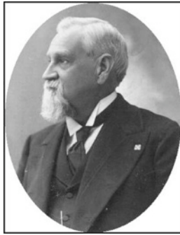
Lt. General Stephen Dill Lee, Commander General, United Confederate Veterans, New Orleans, Louisiana April 25, 1906

"To you, Sons of Confederate Veterans, we will commit the vindication of the Cause for which we fought. To your strength will be given the defense of the Confederate soldiers' good name, the guardianship of his history, the emulation of his virtues, the perpetuation of those principles which he loved, and which you love also, and those ideals which made him glorious, and which you also cherish. "