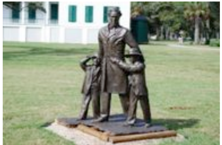
A statue of Jefferson Davis and his sons, Joe and Jim Limber, stands on the grounds of Beauvoir.