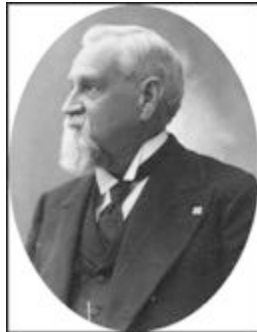
Lt. General Stephen Dill Lee, Commander General, United Confederate Veterans, New Orleans, Louisiana April 25, 1906

"To you, Sons of Confederate Veterans, we will commit the vindication of the Cause for which we fought. To your strength will be given the defense of the Confederate soldiers' good name, the guardianship of his history, the emulation of his virtues, the perpetuation of those principles which he loved, and which you love also, and those ideals which made him glorious, and which you also cherish. "