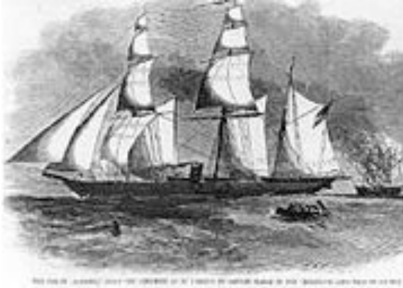
"The Confederate Privateer Steamer Alabama ('290'), Captain Raphael Semmes -- from a photograph taken at Liverpool, where she was built"

to manage the collection of NHHC Underwater Archaeology Branch (UAB) artifacts. This includes issuing loan agreements to various museums interested in displaying US Navy artifacts from underwater archaeological sites. Currently, UAB is responsible for curating approximately 1,400 of 9,000 artifacts in its