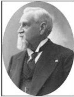
Lt. General Stephen Dill Lee, Commander General, United Confederate Veterans, New Orleans, Louisiana April 25, 1906

"To you, Sons of Confederate Veterans, we will commit the vindication of the Cause for which we fought. To your strength will be given the defense of the Confederate soldiers' good name, the guardianship of his history, the emulation of his virtues, the perpetuation of those principles which he loved, and which you love also, and those ideals which made him glorious, and which you also cherish. "